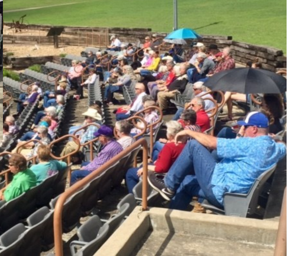
Top and Right: Easter performance by D’Vine Testament on Sunday, April 7 at the Amphitheater.